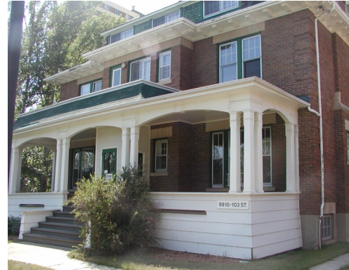
Hilltop House 2019