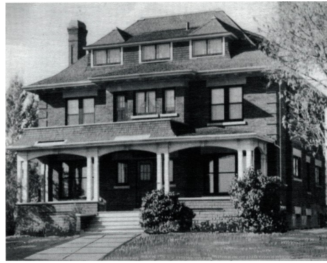
Drawing of Hilltop House circa 1915.