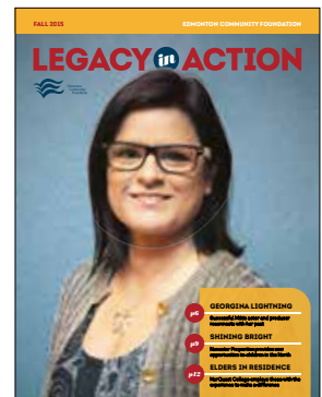
Cover photo supplied

The Bent Arrow Healing Society connects individuals with their heritage.