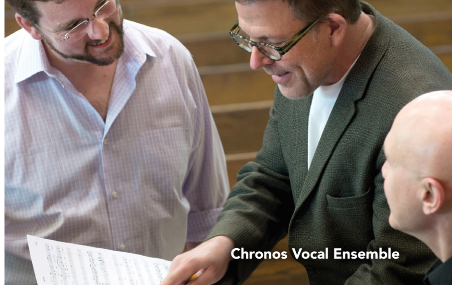
Chronos Vocal Ensemble