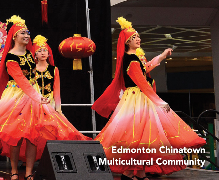
Edmonton Chinatown Multicultural Community