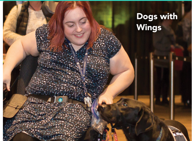
Dogs with Wings