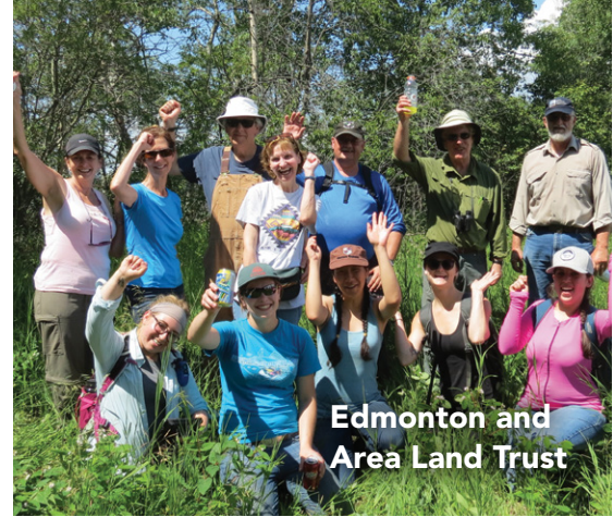
Edmonton and Area Land Trust