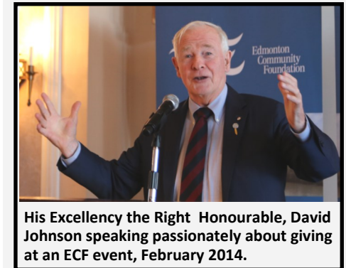
His Excellency the Right Honourable, David Johnson speaking passionately about giving at an ECF event, February 2014.

Believing that every Canadian has something to give, has led to the creation of mygivingmoments.ca —a website that will help Canadians discover what they have to give. Its purpose is to inspire us to say, "Hey, I'm going to do that!"