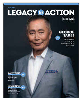
Cover of George Takei